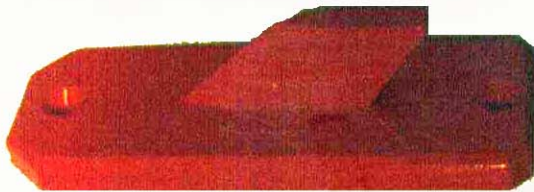
Reference: NE 0058