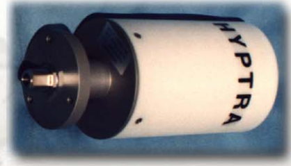
Reference: NE 0704