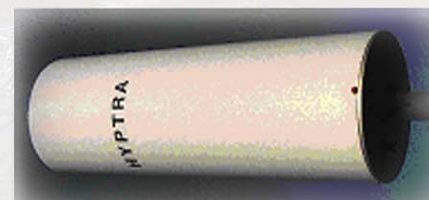
Reference: NE 0706