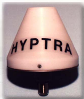
Reference: NE 0022